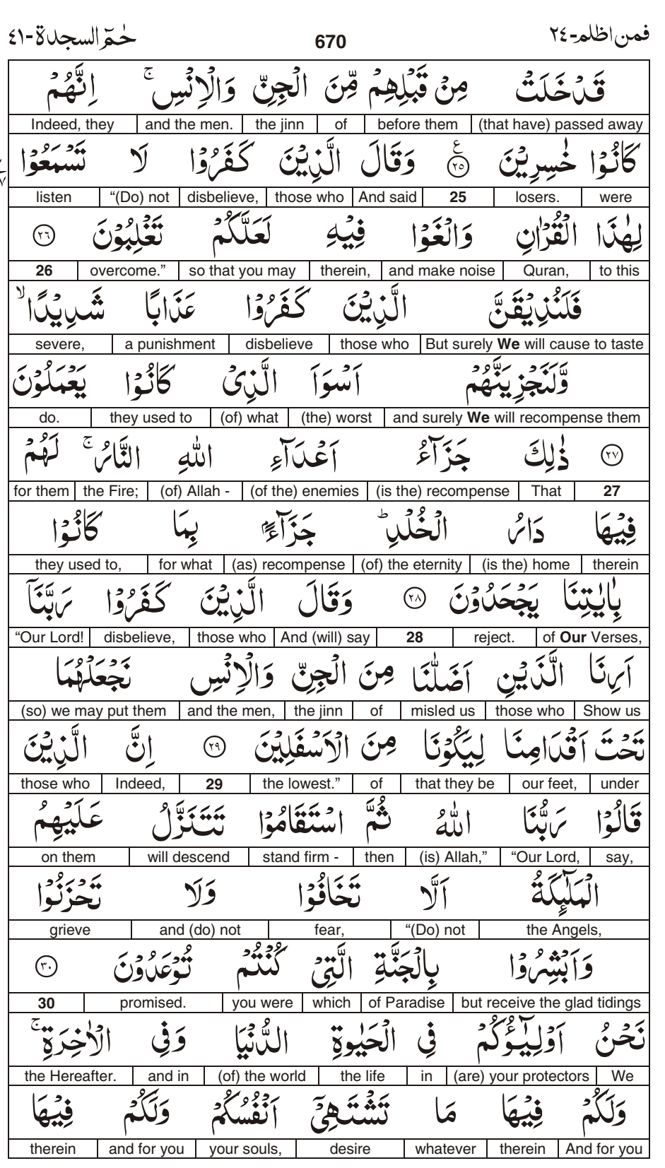
Surah 41: Ha Meem As-Sajdah (v. 26-31)