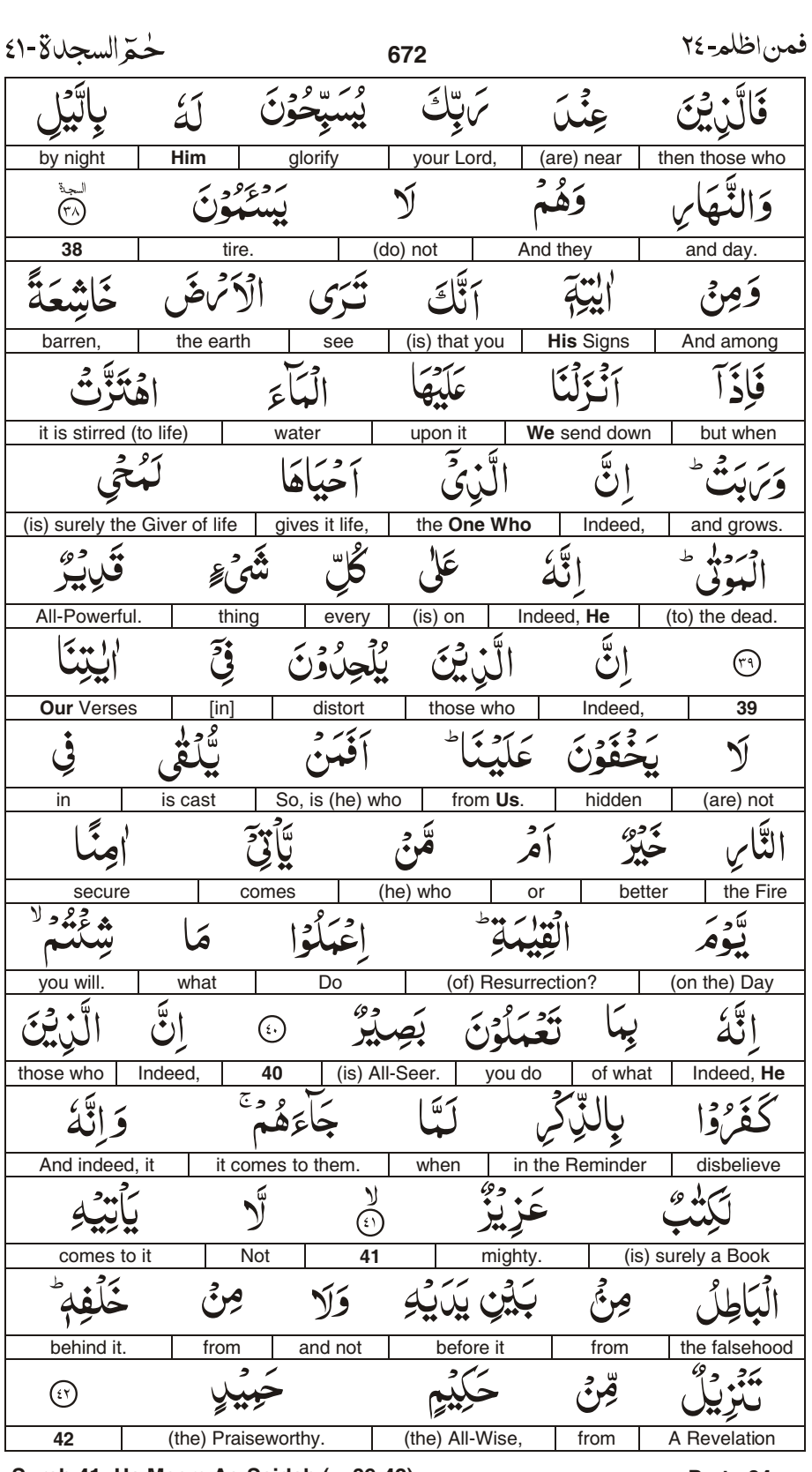
Surah 41: Ha Meem As-Sajdah (v. 39-42)