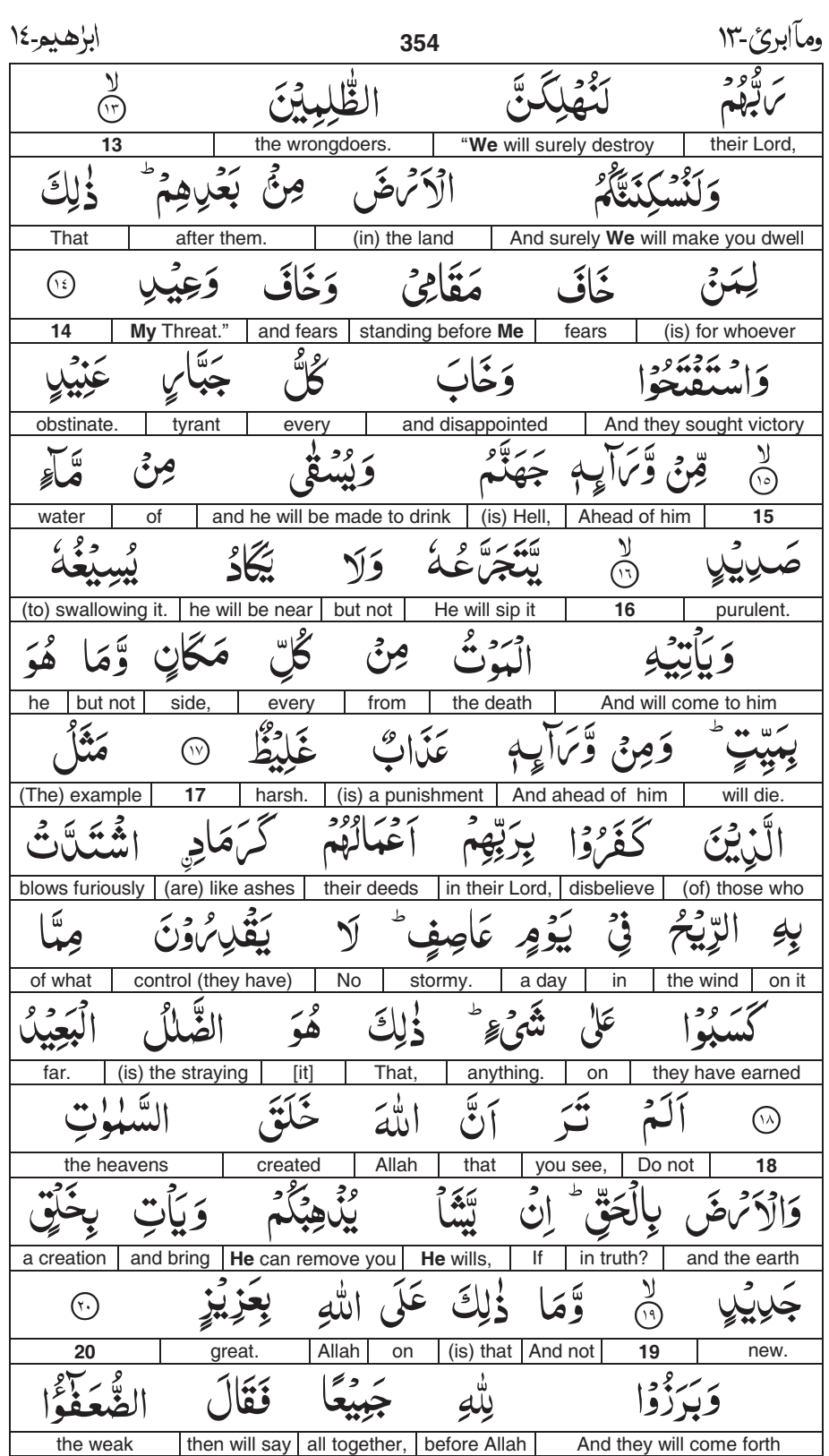
Surah 14: Ibrahim (v. 14-21)