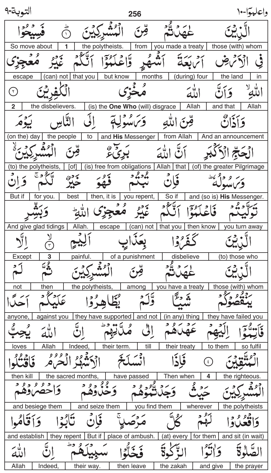
Surah 9: The repentance (v. 2-5)