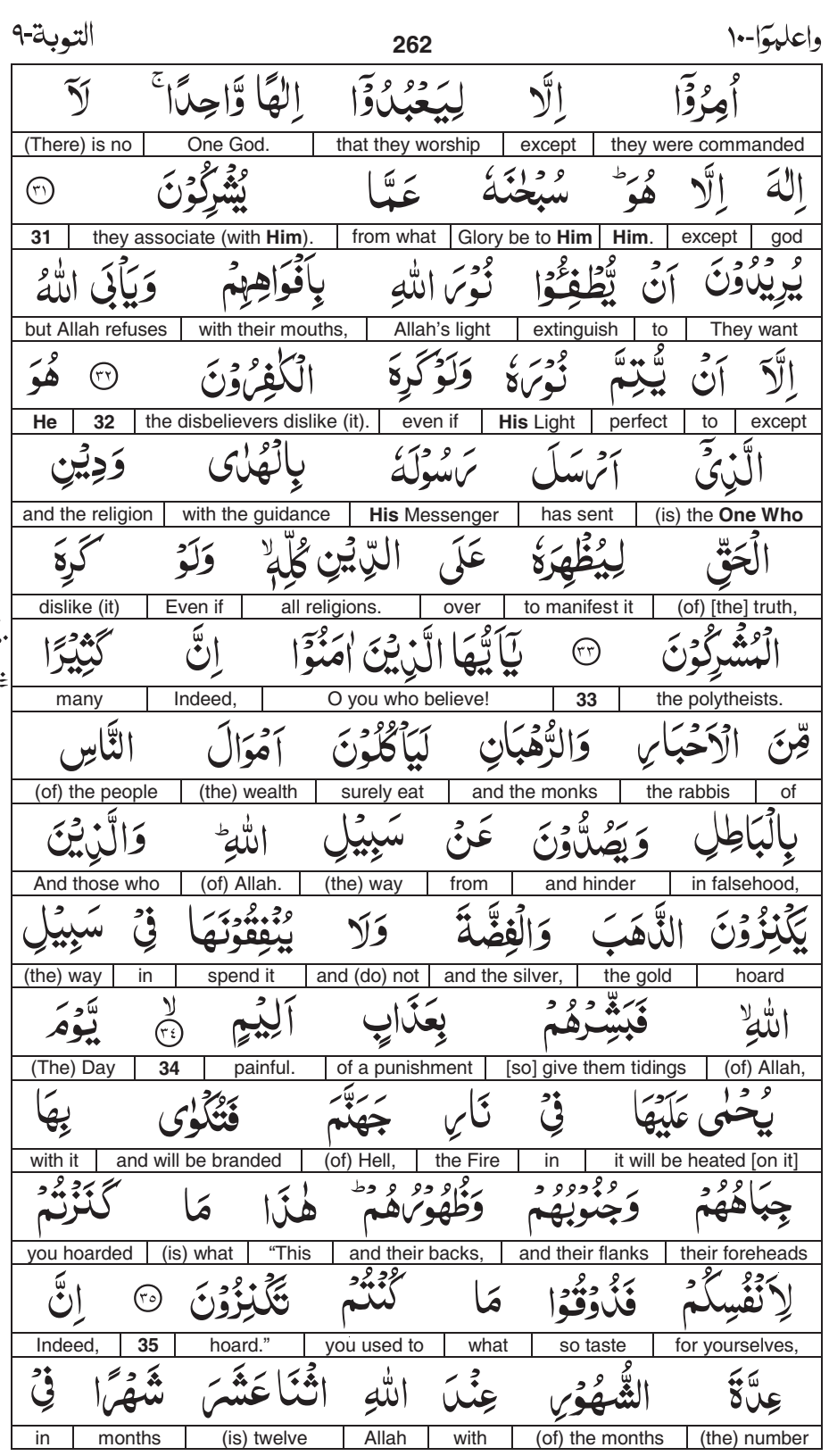
Surah 9: The repentance (v. 32-36)