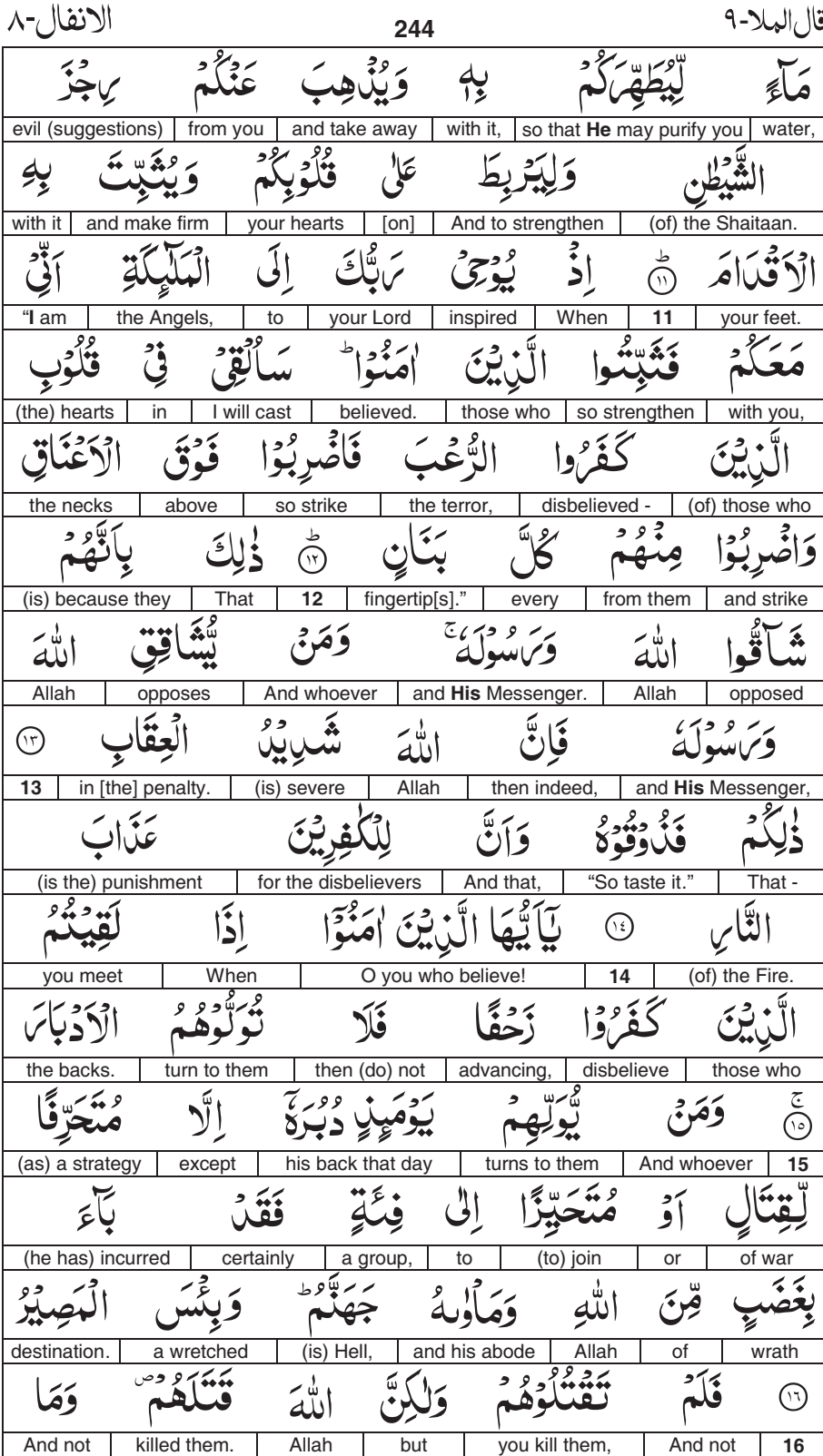
Surah 8: The spoils of war (v. 12-17)